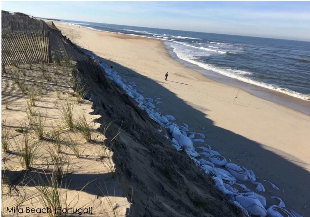
Mira Beach (Portugal)