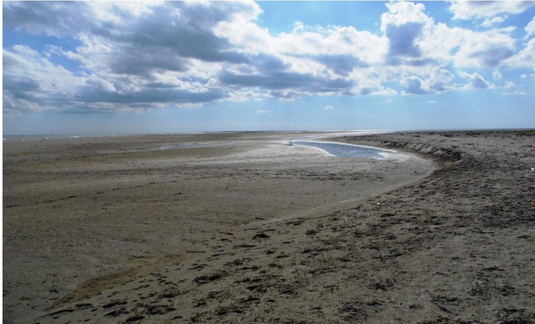
Sacalin spit (Romania)